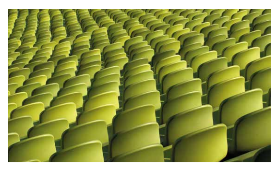
\mbox{\bf PLANOLEN}^{\otimes} is a recycled plastic granule that can be used to make new plastic products