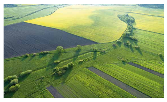
\mathbf{HUMERRA}^{\otimes} is our brand name for premium quality compost products made from organic waste