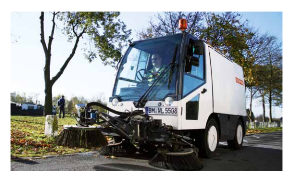
We operate a number of different vehicles enabling us to offer a wide range of city maintenance measures — from keeping parks clean and tidy all the way through to cleaning roads and sewers