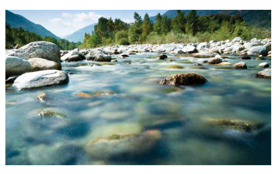
\begin{tabular}{ll} \bf ALUMIN^{\odot}-a & specialty chemical produced from recycling was te containing aluminium — is used to process water \\ \end{tabular}