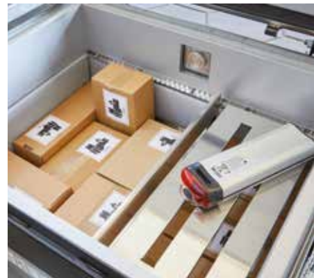
Safe storage of brand new batteries.