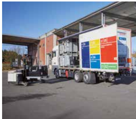
RETRON is applicable as both changing and stationary system.