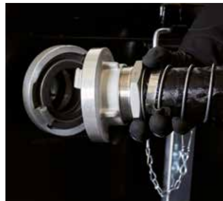
The optional flue gas removal provides for additional safety in case of emergency.