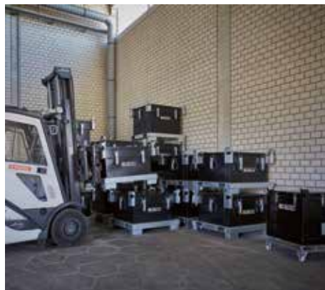
All containers are easily stackable.