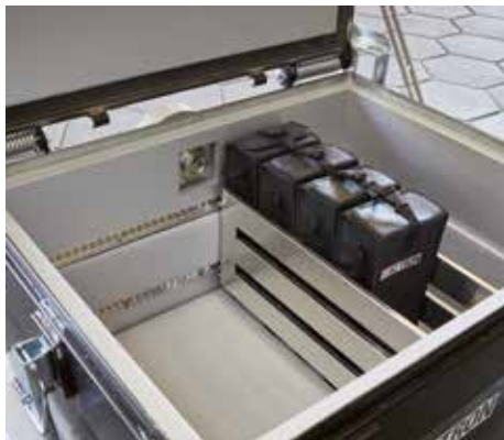
Individually adjustable partition walls prevent contents from shifting during transport and loading.